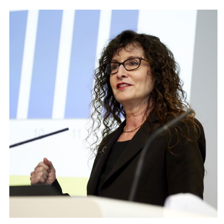
Image: Professor Barbara Rothbaum, Emory Healthcare Veterans Program.

In a novel application, the efficacy of VRE can be enhanced by combining it with cognitive enhancers such as the old antibiotic D-Cycloserine (DCS). In this treatment, VRE is underdosed but preceded by a pill which enhances the learning. A decrease in PTSD symptoms (such as acoustic startle and salivary cortisol reactivity) is observed in patients for up to 12 months using DCS versus controls (alprazolam, placebo).