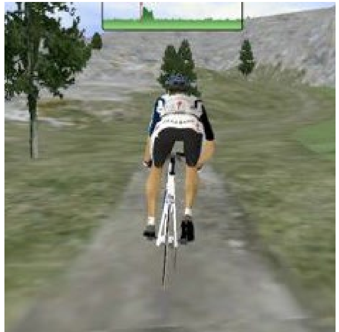
Image : The graphics used to motivate the patient.