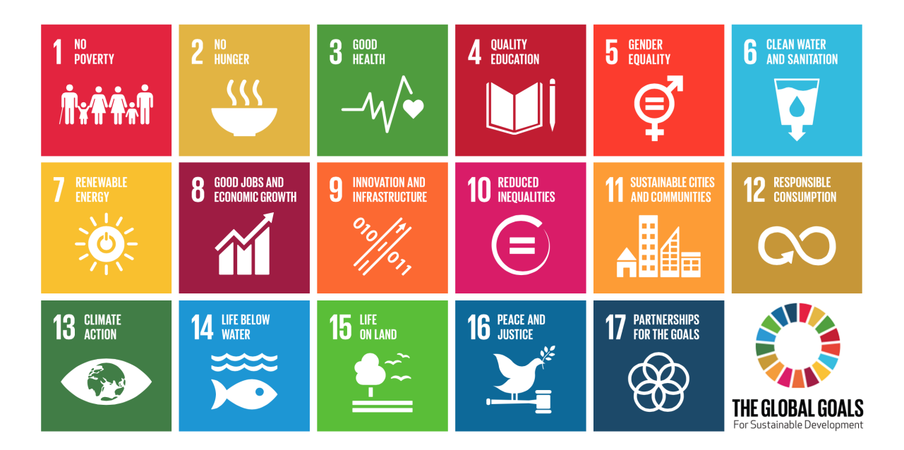
Figure 1: The Sustainable Development Goals

The Sustainable Development Goals (SDGs) are a set of global social, economic and environmental goals, agreed by countries at the United Nations General Assembly in 2015 (Figure 1). These seventeen goals and 169 associated targets have become a common framework for setting priorities for national and international sustainable development policies. Intended to be viewed as indivisible, the SDGs also bring attention to the complex interactions, synergies and trade-offs that exist between different goals and targets at a global, national or local level.<sup>2</sup>