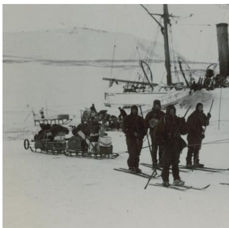
'Ditto - just starting, 11 September 1902.

This resource was developed by teachers within the Royal Society Schools Network