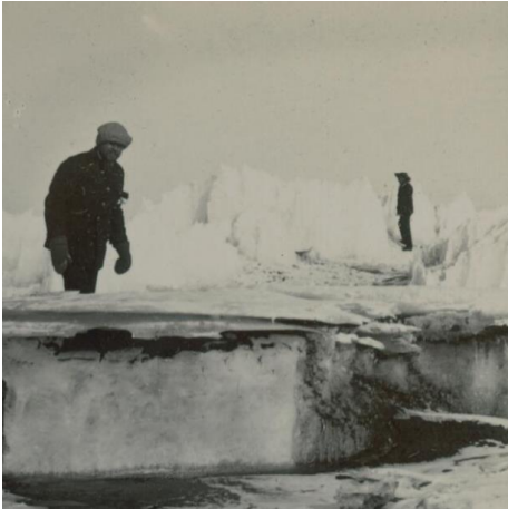
The ice in McMurdo Strait, 08 February 1902.

This resource was developed by teachers within the Royal Society Schools Network