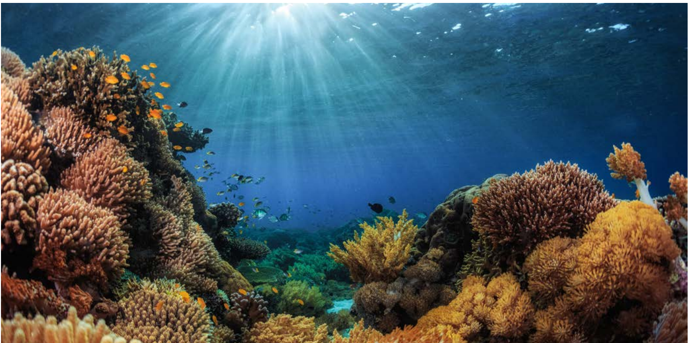
Image: Underwater shot of vivid coral reef with fishes in Indonesia