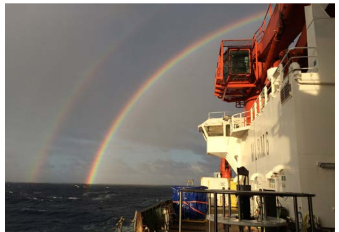
Image: James Cook JC156 voyage to the mid Atlantic ridge

Decision makers can lack the critical scientific evidence to manage and mitigate the wide-ranging impacts of human activity on the ocean and its consequences for society. The Ocean Decade seeks to overcome this hurdle.