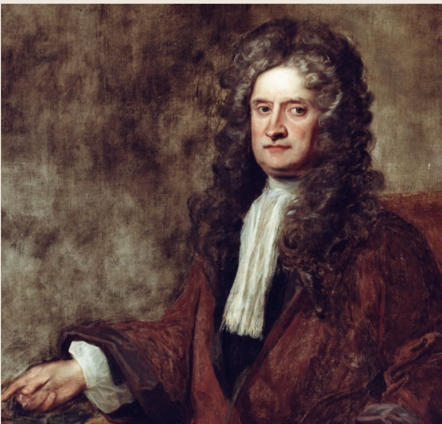
Portrait of Sir Isaac Newton, by Charles Jervas, 1717. Isaac Newton was elected a Fellow of the Royal Society in 1672 and served as its President from 1703 – 1727.

Find out more about the history of the Royal Society at Carlton House Terrace at royalsociety.org/about-us/history