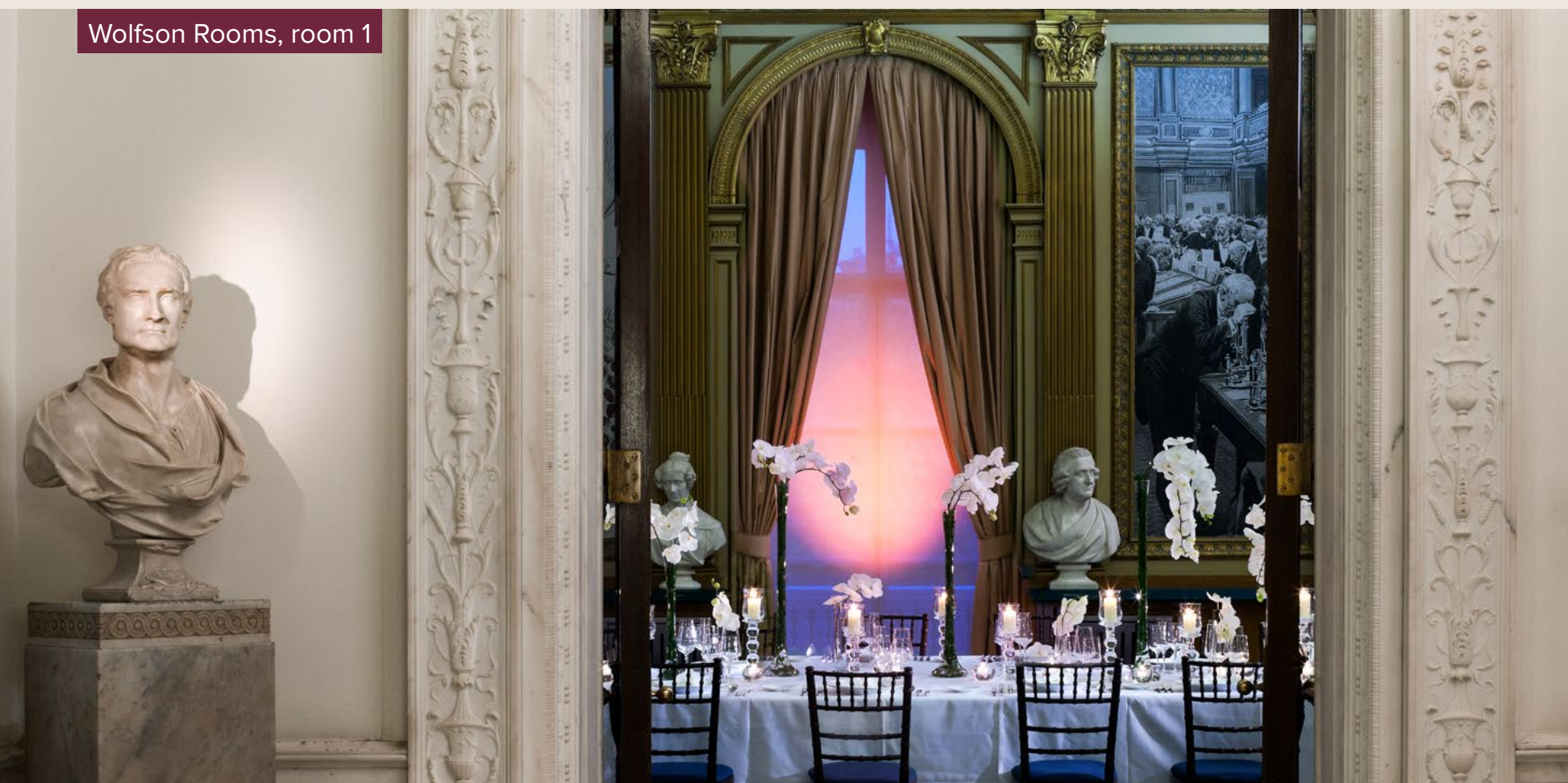
Wolfson Rooms, room 1

We look forward to welcoming you to the Royal Society.