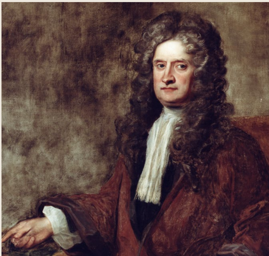
Portrait of Sir Isaac Newton, by Charles Jervas, 1717. Isaac Newton was elected a Fellow of the Royal Society in 1672 and served as its President from 1703 – 1727.

The Royal Society has played a part in some of the most significant and life-changing discoveries in scientific history and our scientists continue to make outstanding contributions to science.