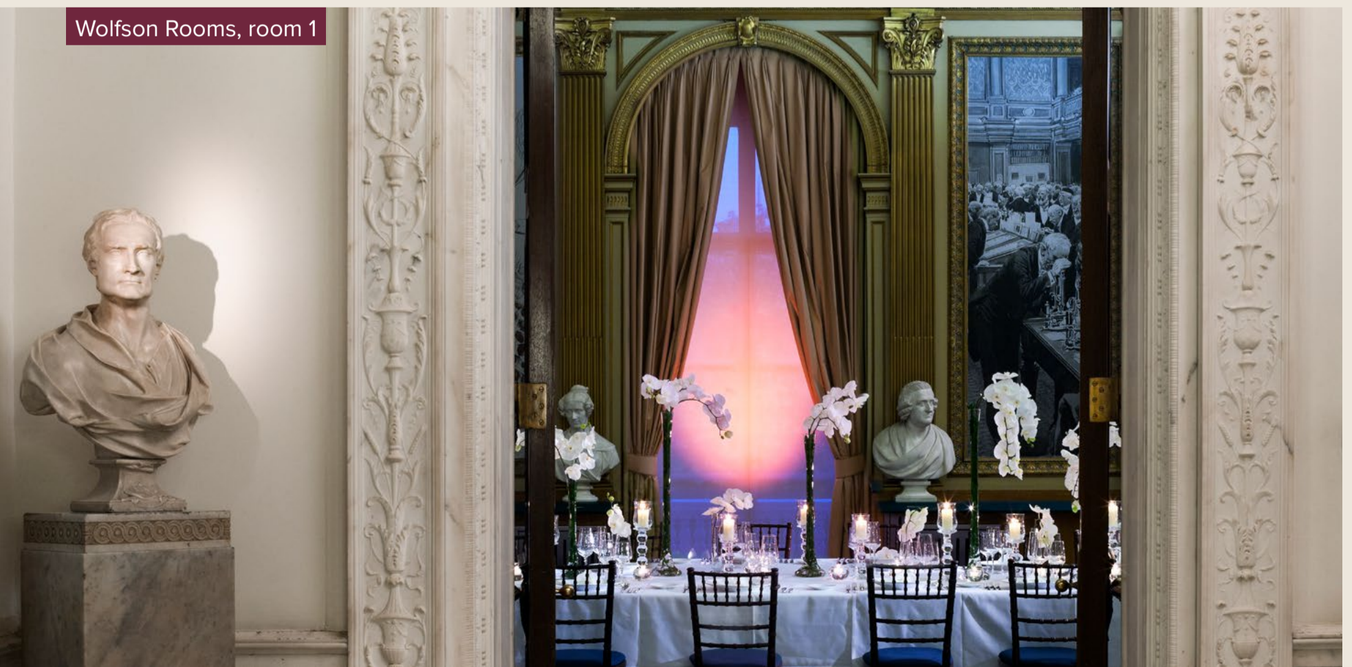
Wolfson Rooms, room 1

We look forward to welcoming you to the Royal Society.